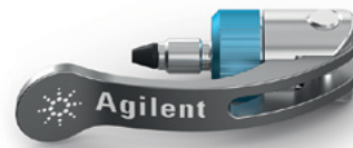
Figure 2. Agilent InfinityLab Quick Connect fitting.

An incorrectly installed column can lead to peak tailing, peak broadening, split peaks, and carryover. Sometimes, faulty connections can also cause damage to the column. InfinityLab Quick Connect and Quick Turn fittings (Figure 2) simplify installation, ensuring a dead-volume-free column connection up to 1300 bar. These fittings reduce the failure rate during column exchange and decrease associated costs caused by destroyed columns.