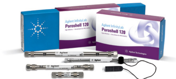
Figure 6. InfinityLab Poroshell 120 columns.

Superficially porous particle (SPP) LC columns can generate high efficiency at lower pressure, relative to their totally porous particle (TPP) column counterparts. The higher efficiency can be used to speed up analyses or improve results—giving better resolution and sensitivity.