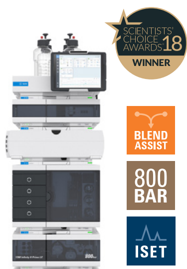
Figure 1. The 1260 Infinity II LC has received the 2018 Scientists' Choice Award for Best New Separations Product.

This white paper illustrates how the new capabilities of the 1260 Infinity II Prime LC can sum up to over 80,000 USD of incremental economic value per year compared to a conventional LC system. This economic value includes the following aspects: 1) reduced cost of operation; 2) reduced downtime; 3) more samples per day; and 4) the utilization of one system for many methods. This white paper can serve as a resource for lab managers while calculating the financial benefit of replacing their current instrumentation with the 1260 Infinity II Prime LC.