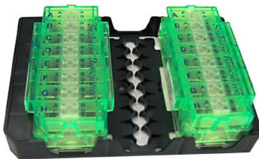
Figure 1 | XFP Carrier Tray holding 2 cartridges supported by miniplates.

Agilent Seahorse XFp Carrier Trays are included with each instrument. These carriers can hold two (2) XFp cartridge/miniplate assemblies or three (3) miniplates without cartridges. They provide easier handling and incubation of the cartridge while in a non-CO 2 incubator or while loading the cartridge on a lab bench. The procedure given below can be performed with or without the XFp Sensor Cartridge inserted in the carrier.