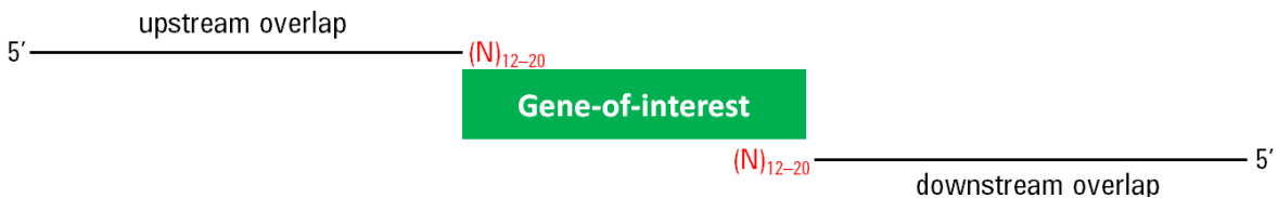
Figure 2 PCR method for adding overlap sequences to the 5' and 3' PCR primers