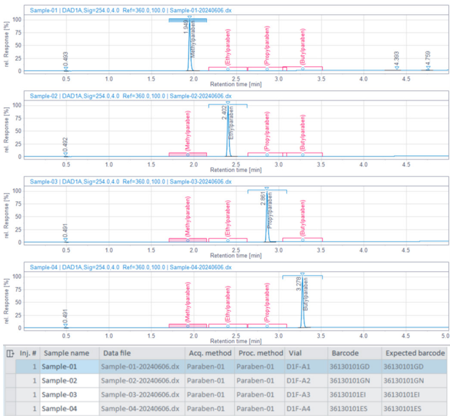
Figure 2. Results of data analysis after sequence run. The injection list shows the expected barcode for confirmation with the matching barcode, as well as the respective vial position. The chromatograms show the expected compounds.