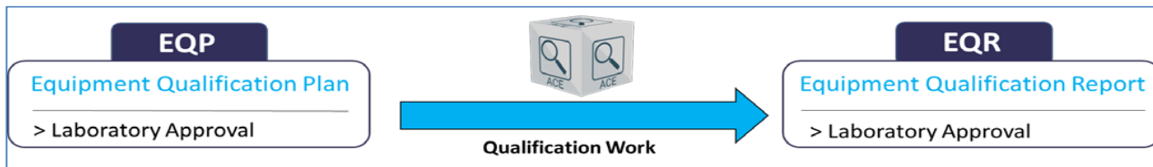
High-level ACE Qualification Workflow