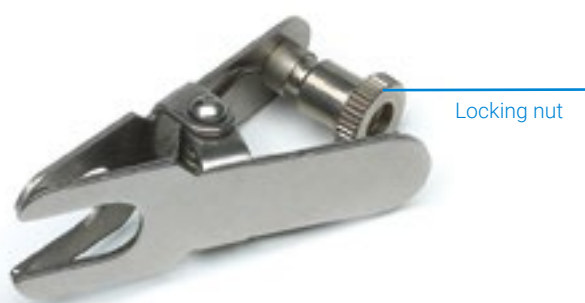
Figure 4a. Use the standard torch clamp with the fully demountable ICP-OES inert torch.

Turn the locking nut on the clamp clockwise (if necessary) to ensure there is enough room to open the clamp.