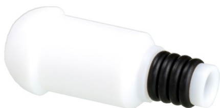
Figure 1a. PTFE ball joint coupler used with the semi-demountable inert torch