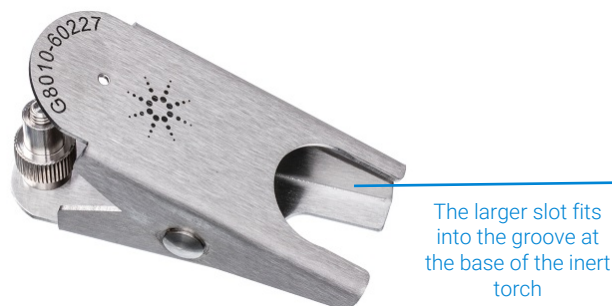
Figure 4b. Clamp recommended for use with the semi-demountable ICP-OES inert torch and the MP-AES inert torch.