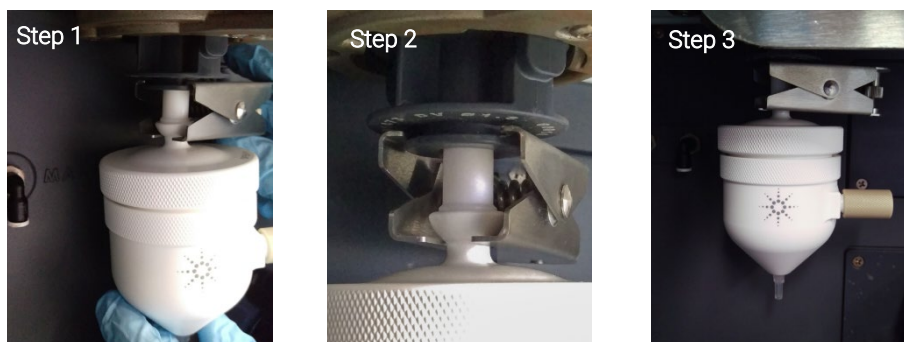
Figure 5. Installing the inert spray chamber onto the semi-demountable ICP-OES inert torch. The procedure is the same on the MP-AES.