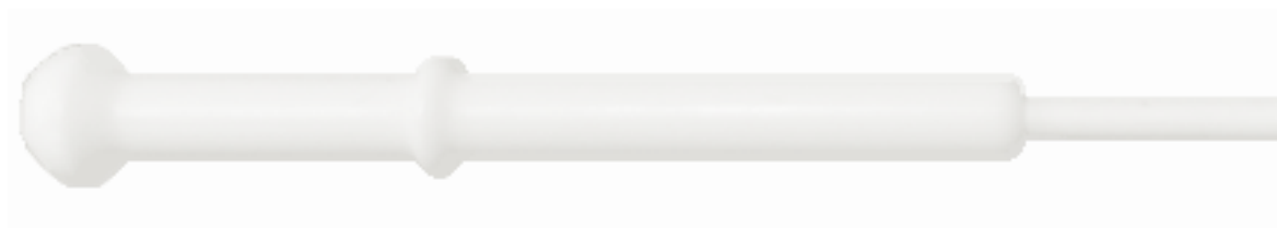
Figure 1b. PTFE ball joint coupler and injector assembly used with the fully demountable inert torch.