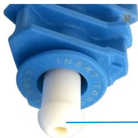
PTFE ball joint coupler fitted to the free end of the alumina injector tube