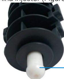
PTFE ball joint coupler fitted to the free end of the alumina injector