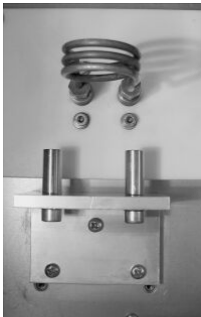
Figure 2. Stand-offs fitted