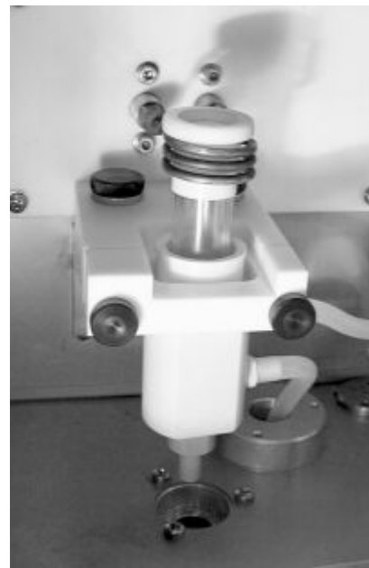
Figure 3. Torch with alignment tool