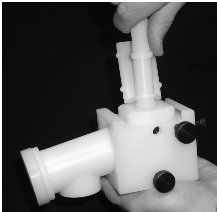
Figure 1. Screw the drain tube into the nebulizer block