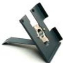
Figure 1. ETC 60 workhead Mk 2 bracket

To install the ETC 60 workhead Mk 2 bracket: