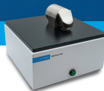
5500 Compact FTIR