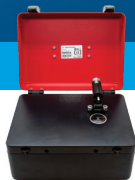
4500 Portable FTIR