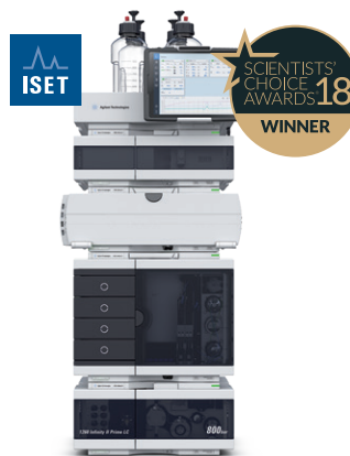
Agilent 1260 Infinity II Prime LC Everyday efficiency with more convenience