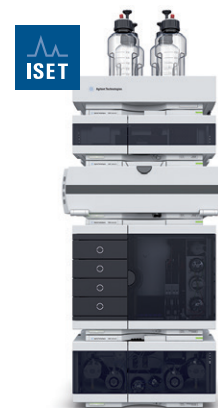
Agilent 1290 Infinity II LC The benchmark in efficiency