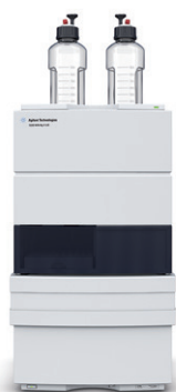
Agilent 1220 Infinity II LC Affordable efficiency

From routine analysis to cutting-edge research, the Agilent InfinityLab LC Series offers the industry's broadest portfolio of liquid chromatography solutions, helping you to achieve highest operational efficiency while keeping within your budget.