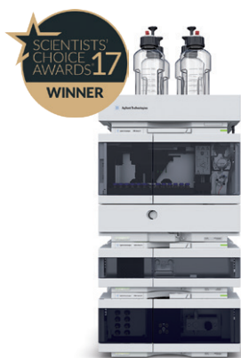
Agilent 1260 Infinity II LC Everyday efficiency