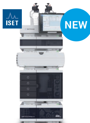
Agilent 1260 Infinity II Prime LC Everyday efficiency with more convenience