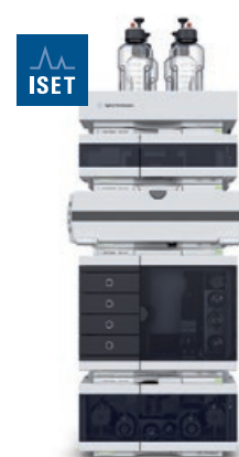
Agilent 1290 Infinity II LC The benchmark in efficiency