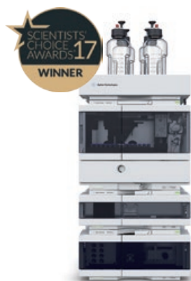
Agilent 1260 Infinity II LC Everyday efficiency