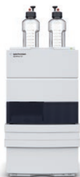
Agilent 1220 Infinity II LC Affordable efficiency

From routine analysis to cutting-edge research, the Agilent InfinityLab LC Series offers the broadest portfolio of liquid chromatography solutions, helping you to achieve highest operational efficiency while keeping within your budget.