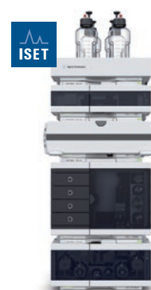
Agilent 1290 Infinity II LC The benchmark in efficiency