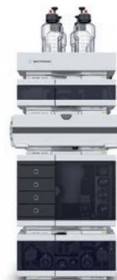
Agilent 1290 Infinity II LC The benchmark in efficiency