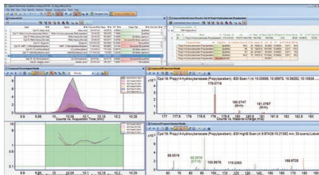
Straightforward data mining and unambiguous identification using All Ions Software.

Simply put, the Extractables and Leachables PCDL makes compound confirmation and data mining easier for high-throughput labs and labs new to LC/MS alike.