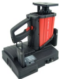
4100 ExoScan Docking Station

Agilent offers two distinct non-destructive FTIR analyzers: the 4100 ExoScan and 4200 FlexScan. These systems provide the same high quality answers. The 4100 ExoScan is the more versatile option; the ExoScan's docking station allows for easy method development paired with the flexibility to measure on-site, non-destructively. The interchangeable sample interfaces allow measurement of many different sample types. The 4200 FlexScan has a slightly smaller form factor, allowing it to be use in tight spaces for dedicated applications. Both are battery operated and controlled by a handheld computer allowing unrestricted use.