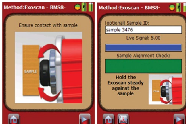
Step 1: Ensure contact

The PDA controlled FTIR analyzers feature easy-to-use software that rapidly and automatically provides answers, enabling users with varying experience levels to obtain reliable information.