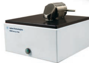
Agilent 5500 Series FTIR Spectrometers