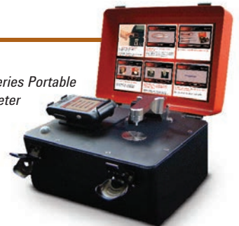
Agilent 4500 Series Portable FTIR Spectrometer