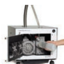
Easy access to pump