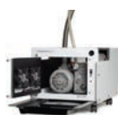
Removable oil tray