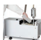
Easy access to pump