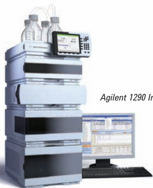
Agilent 1290 Infinity LC