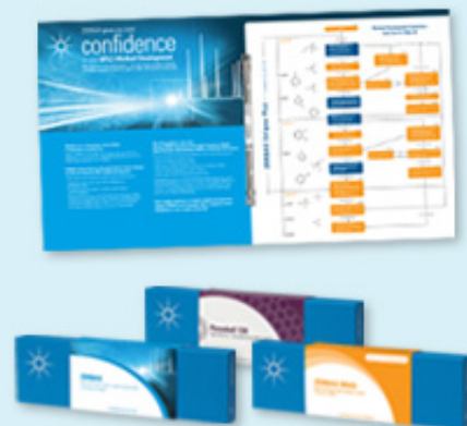
ZORBAX RRHD, including ZORBAX 300Å RRHD biocolumns, Poroshell 120, and ZORBAX Eclipse Plus columns

Achieve total confidence in your HPLC method development. Get yours now!