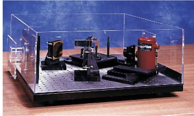
A grazing angle experiment, incorporating a photoelastic modulator for the analysis of thin films on metal