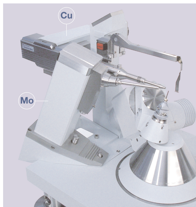
Co-mounted Enhance Ultra (Cu) and Enhance (Mo) X-ray sources.

Available to buy outright or as an upgrade, the Enhance Ultra can be co-mounted alongside the Agilent Technologies hi-flux molybdenum Enhance thus providing an X-ray source which is ideal for both small molecule and protein applications.