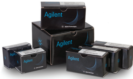
Figure 2. Agilent SureSelect library prep and target enrichment reagent kits.