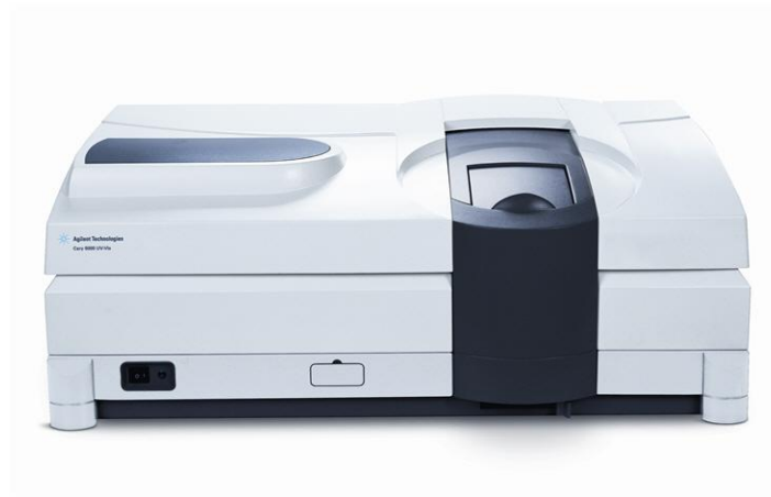
Cary 4000, 5000 and 6000i instruments provide a wide linear dynamic range

Photometric linearity affects how accurately an instrument measures absorbance with increasing optical density or concentration. Poor photometric linearity will produce incorrect results and cause calibrations to become non-linear. The 'addition of filters' technique provides a simple and inexpensive means of demonstrating the photometric linearity and range of most spectrophotometers without the need for standards. This test demonstrates photometric range and linearity of the New Generation Cary 4000/5000/6000i spectrophotometers at high absorbance levels. Routine, or high precision, linearity tests should be performed using the Linear Neutral Density Kit part number 9910056100.