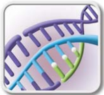
CRISPR SureDesign Workspace