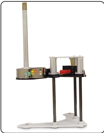
Figure 1 The Agilent Removeable Cold Probe Accessory pictured in the down, mid-cycle, and up position.