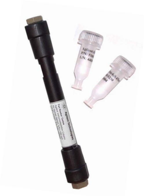
Figure 1. Multiple Affinity Removal Column and Cartridges.

In addition, validated reagents for sample preparation in biomarker discovery and other proteomics applications are also available, including a standard for proteomic workflows. For your convenience, these reagents are fully compatible with Agilent LC/MS methods and require no additional sample pretreatments.