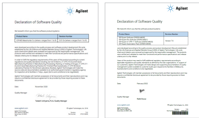
An example of the Declaration of Software Quality delivered with the ICP-MS MassHunter software (left) and the ICP Expert 21 CFR Part 11 software kit (right).

Agilent has a strong focus on regulatory compliance with a Quality Management System, product lifecycle documentation, and declarations of product validation for software development all in place.