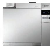
Agilent 7820A GC