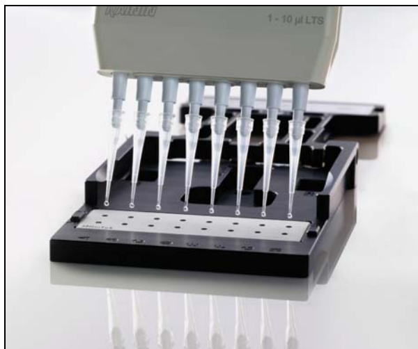
Figure 2. Loading of the Take3 Multi-Volume Plate performed with an eight-channel pipettor.

The Take3 Multi-Volume Plate has 16 microspots arranged as 8 rows and 2 columns in standard SBS format for micro-volume analysis. 2 \mu L volumes of a sample can be pipetted into individual microwells or a multichannel pipettor may be used to load eight samples simultaneously (see Figure 2).