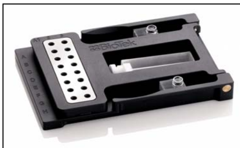
Figure 1. Take3™ Multi-Volume Plate shown with two BioCells and one standard cuvette in place.

Accurate quantification of isolated nucleic acids is required to ensure that proper amounts of starting material are introduced for maximum efficiency of enzymatic reactions that take place in downstream genomic applications. These applications include sequencing, genotyping, and both differential and quantitative gene expression analysis. Classically, quantification is performed spectrophotometrically at 260 nm in quartz cuvettes with defined measurement pathlengths of 1 cm. Recently, BioTek developed the Epoch Multi-Volume Spectrophotometer System which includes the new Take3 Multi-Volume Plate (see Figure 1). This system enables measurements in 1 cm cuvettes (including BioCell), microplates with variable measurement pathlengths (dependent on plate well geometry and volume of solution) and micro-volume measurements using a defined path length of 0.5 mm 1,2 . Micro-volume spectrophotometric measurements have the added benefit of requiring no sample dilution prior to analysis.