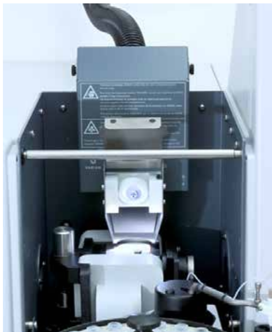
Figure 3. The optional extraction/LED accessory for the Agilent furnace.

The optional fume extraction accessory (Figure 3) includes an LED lighted mirror to provide a clear view of the graphite tube injection hole. Alignment of the autosampler capillary is worry-free while the exhaust system removes ashing vapors at their source. The extraction accessory provides flexibility of the furnace placement eliminating the need for direct position under the exhaust fan.