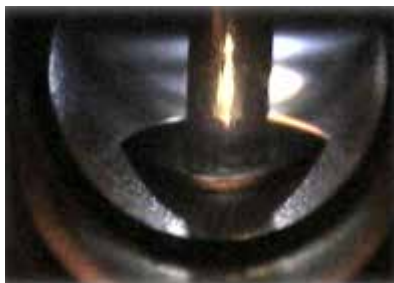
Figure 1. The view inside the tube, using the integrated camera. The probe is dispensing the sample into the tube.

Based on the results of the chemometric analysis, the Surface Response Methodology tool determined the optimum conditions, shown in Tables 1 and 2, and Figure 2.