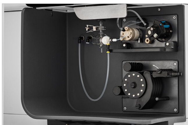
Figure 1. The Agilent Advanced Valve System (AVS) six port valve

All measurements were performed using an Agilent 5110 SVDV ICP-OES fitted with an AVS 6 port valve and configured with an SPS 4 autosampler. The sample introduction system consisted of a SeaSpray nebulizer, double-pass cyclonic spray chamber and a 1.8 mm i.d injector torch. Tables 1 and 2 list the operating conditions used for the ICP-OES and the AVS 6 (Figure 1).