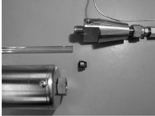
Figure 1 Proper Ferrule Orientation to the Large Quartz Tube