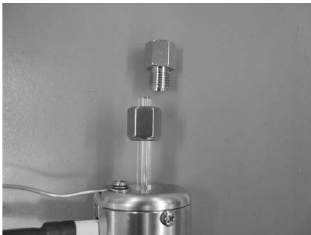
Figure 3 NCD Tube Replacement Detail