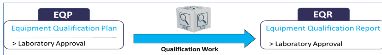
High-level ACE Qualification Workflow