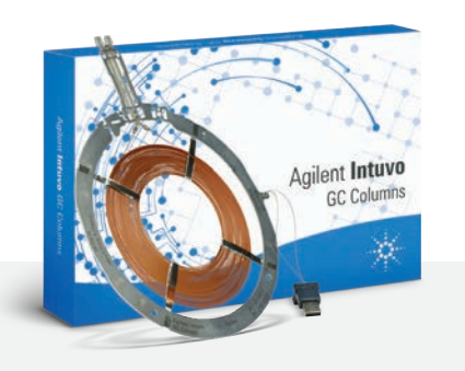
Industry-proven GC columns configured in the revolutionary Intuvo form factor offer exceptional chromatographic performance and reliability.