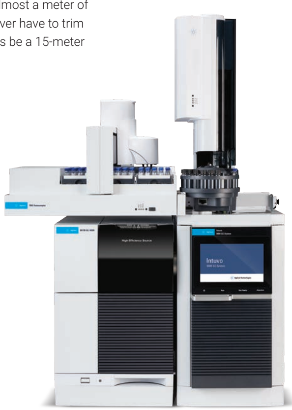
Agilent Intuvo 9000 GC system with Agilent 5977B and 7693 autosampler

Intuvo Guard Chip retention gap technology and no-trim columns work hand in hand. The Guard Chip is a disposable chip that is easily installed and replaced in less than a minute. This chip provides almost a meter of protection just before the Intuvo GC column. You will never have to trim a column again. Imagine—a 15-meter column will always be a 15-meter column. No more peak shifting!